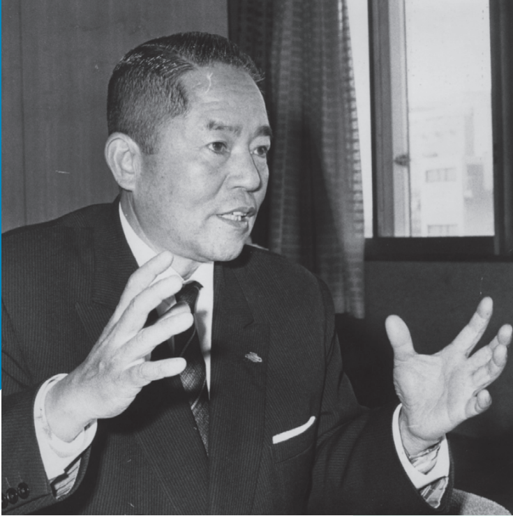
YKK's Founder, Tadao Yoshida